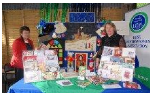
ICA displaying various craftwork